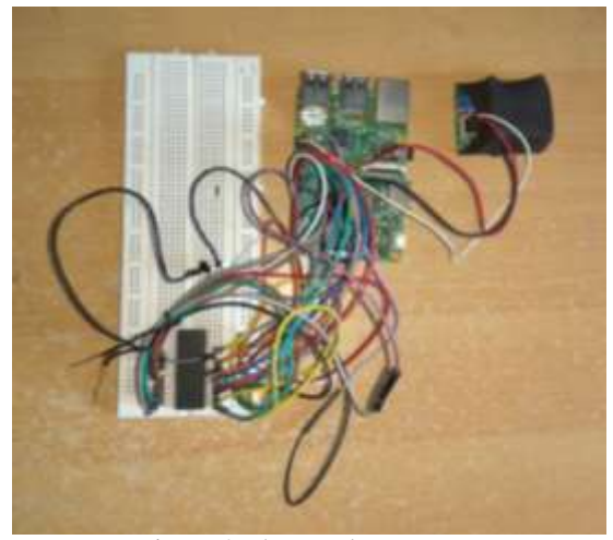
Figure 2: The Hardware setup

The figure below shows the working model of patient health monitoring system. In this system the central controller collects the data from the sensors and sends the data through WiFi. The data can be accessed anytime by the doctors by typing the corresponding unique IP address in any of the internet browser at the end user device (laptop, PC, mobile phone, tablet etc).