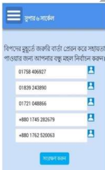
Figure 1. Super six circle for sending an emergency message to users nearest support person during harassment

Super six circle is shown in Figure 1, which is an essential and practical solution approach for the victims of Sexual Harassment. By using our developed application, users can easily predefine Five contacts from her contact list to send messages at Emergencies. Those contacts will be automatically saved in databases. Therefore, just in one touch, an Emergency message will be sent to those predefined contacts to request for help in danger, which is shown in Figure 2. Another thing is that the user can change those numbers according to her needs.