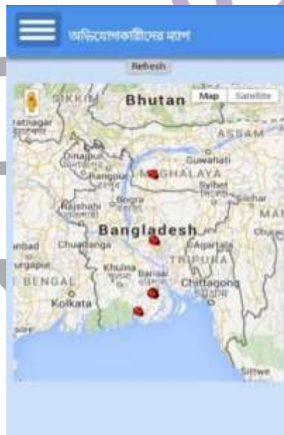
Figure 4. User can see a map that represents the most alarming zone in red color

The idea is to bring high-risk areas to the attention of the authorities so action can be taken. Users of this application can easily see the map of victims reporting area in Red Color, which is shown in Figure 4. The reporting area will be shown on the map according to the GPS position of the Victim. From this, it can easily be determined which area of the country is most affected by these problems.