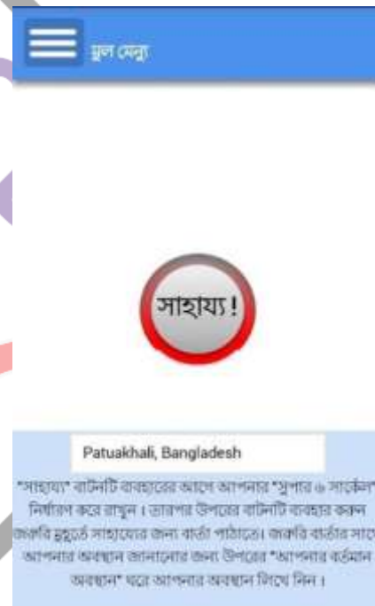
Figure 2. One-touch solution for emergency help