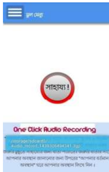
Figure 5. User can record the evidence of a victim by just press volume plus button