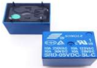
Channel 5V Cube Relay Module

they refresh the signal coming in from one circuit by transmitting it on another circuit. Relays were used extensively in telephone exchanges and early computers to perform logical operations.