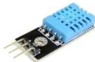
DHT11 Temperature & Humidity Sensor

The DHT11 is a commonly used Temperature and humidity sensor. The sensor comes with a dedicated NTC to measure temperature and an 8-bit microcontroller to output the values of temperature and humidity as serial data. The sensor is also factory calibrated and hence easy to interface with other microcontrollers. The sensor can measure temperature from 0°C to 50°C and humidity from 20% to 90% with an accuracy of \pm 1^\circ\text{C} and \pm 1\% . So, if you are looking to measure in this range then this sensor might be the right choice for you. The DHT11 is a basic, ultra-low-cost digital temperature and humidity sensor. It uses a capacitive humidity sensor and a thermistor to measure the surrounding air, and spits out a digital signal on the data pin (no analog input pins needed). It's fairly simple to use, but requires careful timing to grab data. You can get new data from it once every 2 seconds, so when using the library from Adafruit, sensor readings can be up to 2 seconds old. Comes with a 4.7K or 10K resistor, which you will want to use as a pullup from the data pin to VCC.