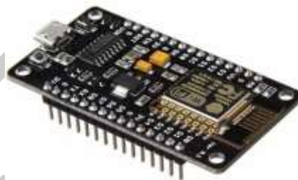
Node MCU Development Board.

The Idle mode stops the CPU while allowing the SRAM, Timer/Counters, USART, 2-wire Serial Interface, SPI port, and interrupt system to continue functioning. The Power-down mode saves the register contents but freezes the Oscillator, disabling all other chip functions until the next interrupt or hardware reset. In Power-save mode, the asynchronous timer continues to run, allowing the user to maintain a timer base while the rest of the device is sleeping.