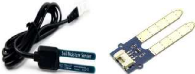
Soil Moisture Sensor

soil moisture devices in coarse soils since most devices require close contact with the soil matrix that is sometimes difficult to achieve in these soils. The basic technique for measuring soil water content is the gravimetric method. Because this method is based on direct measurements, it is the standard with which all other methods are compared. Unfortunately, gravimetric sampling is destructive, rendering repeat measurements on the same soil sample impossible. Because of the difficulties of accurately measuring dry soil and water volumes, volumetric water contents are not usually determined directly. Measuring soil moisture is very important in agriculture to help farmer for managing the irrigation system.