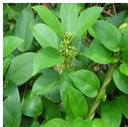
Figure 1: Gymnema Sylvestre ( Gurmar ) [29]

The word “ Gymnema ” is derived from the Hindi word “ Gurmar ” meaning “sugar destroyer or sweet destroyer” [20] [28]. In English, it is called Periploca of the woods, and Meshashringi , madhunashini in Sanskrit [20]. The leaves of Gymnema are bitter, astringent, and acid. They temporally paralyze the sensory perception of sweets and due to this amazing property, it is known as “ GUDMAR ” [28]. It is a wonderful plant to cure diabetes [19] [29]. Gymnema Sylvestre (Morasingi) is called madhumeha destroyer (glycosuria) and is also used for other urinary disorders [16].