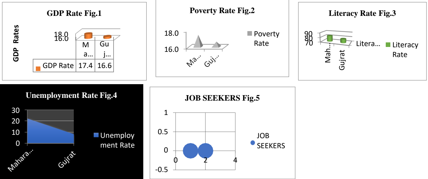
Figures: Factor Impacting GDP, Poverty Rate, Literacy Rate, Unemployment and Job-Seeking

Economic Overview: Both Maharashtra and Gujarat exhibit strong economic performance, with Maharashtra having a higher GDP of 17.4 compared to Gujarat's GDP of 16.6. Despite their economic strength, both states experience poverty, with Maharashtra's poverty rate at 17.4% and Gujarat's at 16.6%.