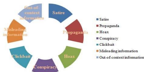
Fig. 1. Different types of Fake News