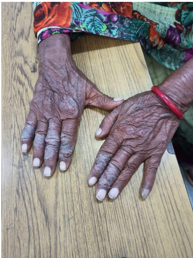
FIGURE-2 :Before Treatment

*the numbers in bold font represent the option selected