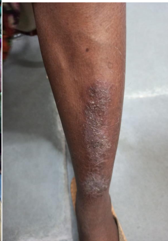
FIGURE-3: Before Treatment