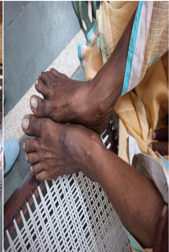
FIGURE-6: After Treatment