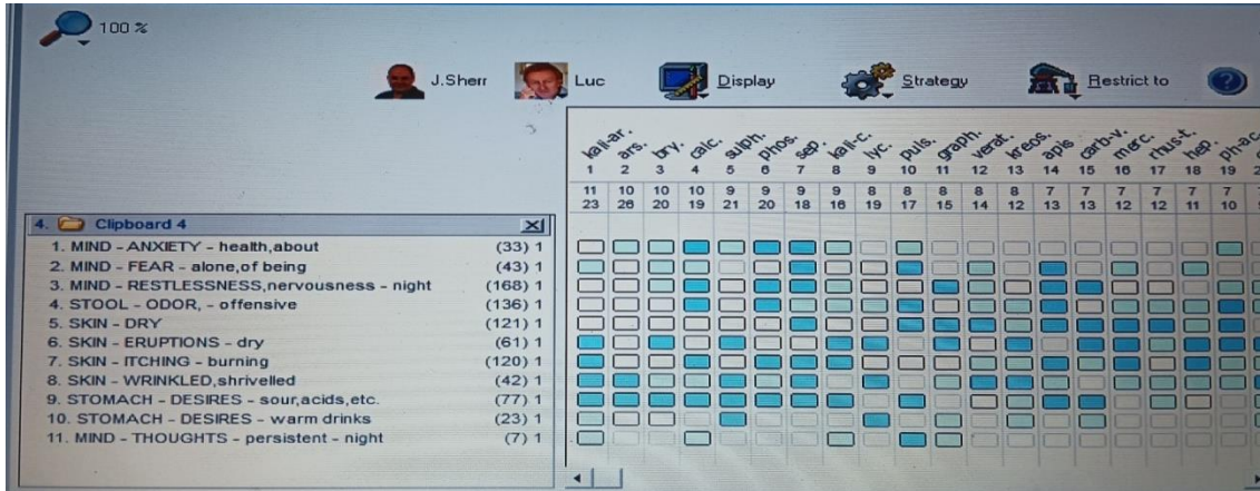
FIGURE-1: Repertorisation chart

over physical generals and then to particular symptoms, Kalium arsenicum was found to cover 11 symptoms scoring 23 marks while Arsenicum album covered 10 rubrics getting 26 marks[Figure 1] Arsenicum album patients are very fastidious but in this case the patient was not at all fastidious, although loneliness is present in both the remedies but arsenicum album manifests this as fear and insecurity whereas Kalium arsenicum patient seeks for support from family which was very prominent in this case [11] . Moreover Kalium Arsenicum patients are more chilly and restless more marked compared to Arsenicum Album patients which were present in the patient. Although Kalium Arsenicum and Arsenicum album both got highest grades after repertorisation finally Kalium Arsenicum was selected after consultation from different materia medica [12] .