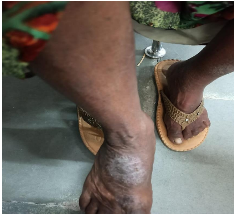
FIGURE-4: Before Treatment