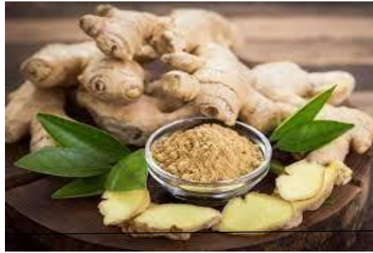
Fig:-Ginger ( Zingiber officinale )