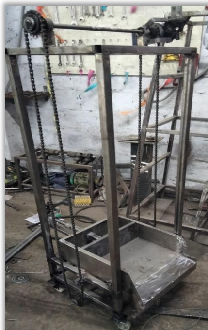
Fig. 5 Prototype model

The machine is placed near the wall and attached with a clamp unit with plain surface area on the top of the machine. The concrete cement paste is poured into the storage tank of the machine which moves with the column area vertically. In order to ensure that the blade edges contact the wall surface equally, the machine is secured to the wall. Depending on the amount of wall dimensions to be given to the wall, the inclined column is adjusted to the desired inclination angle. The tank is lowered to the appropriate height. The push rod that slides on the inclined column tends to advance inward into the box as a result of the box upward movement the push rod within the box keeps the box shut and prevents paste leakage since it contains a plate and rubber cushion at the other end.