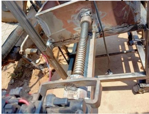
Fig. 2 Screw Rod setup

Screw Rod: A screw rod, also known as a lead screw or a power screw, is a mechanical component that converts rotational motion into linear motion. It consists of a threaded rod or shaft and a nut that contains matching threads. As the rod is rotated, the nut moves along the length of the screw, converting the rotary motion into linear motion.