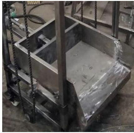
Fig. 4 Storage Tank setup for mortar

Supporting frame: The frame of a wall plastering machine is a structural component that provides support and stability to the various other components of the machine. It is typically made of a strong and durable material, such as steel and is designed to withstand the stresses and forces involved in the plastering process. The frame is typically designed to be lightweight and portable, so that it can be easily moved to different job sites. It may have various features, such as handles or wheels that make it easy to manoeuvre and transport.