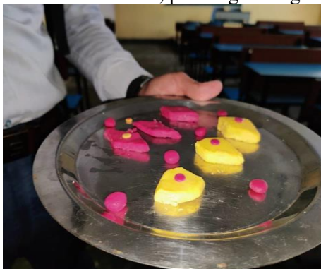
Biocolor fortified Sandesh

Garnish each Sandesh with chopped pistachios or almonds, pressing them gently into the surface.