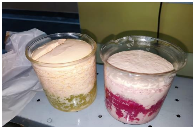
Biocolor Fortified Curd