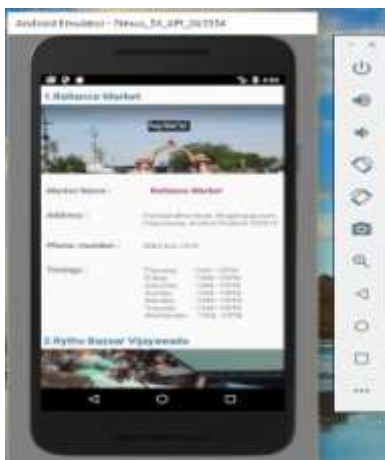
Fig.5: Supermarkets List