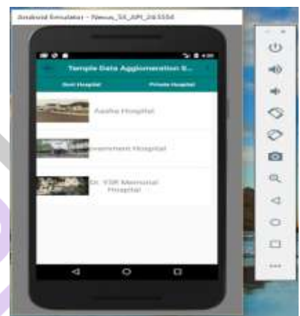
Fig.7.Select Particular Hospital from List