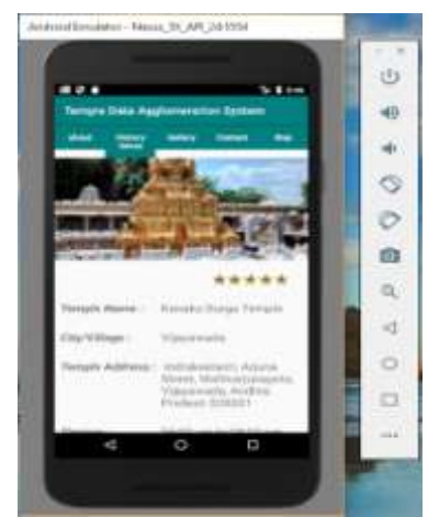
Fig.4.Select Particular Temple from List