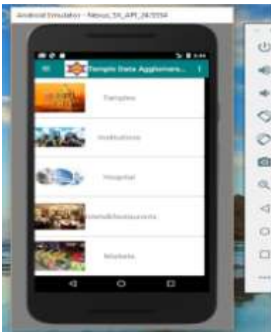
Fig.2: Home Page