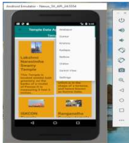
Fig.3.List of Temples in some Districts