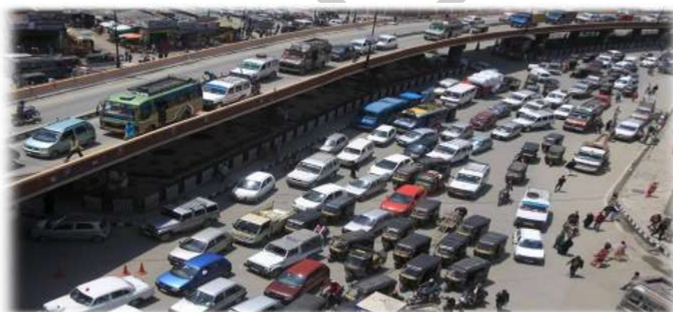
FIG: Showing traffic congestion at Jehangir Chowk, Srinagar

The study aims at bringing to the fore the extent and causes of congestion. It also models the effect of on-street parking on the volume by capacity (V/C) ratio and hence level of service (LOS). The study is dedicated to the central area (CBD and periphery) of the SMR which the most congested area is. The study area in Srinagar City has been divided into five zones. Seventeen arterials and five sub-arterials are selected for the said study from within the study area. Data are collected for traffic volume count, road geometry, pedestrian count, free flow and average travel speed, varying travel speed, travel time and travel cost at different links. Household interview survey is also conducted. Roadway congestion index is separately determined for arterials and sub-arterials. The relationship between the ratio of volume to capacity and the ratio of street area occupied by parked vehicles to total area of street-space is also being modelled. It also locates the peak traffic volume so that people can change route during that time.