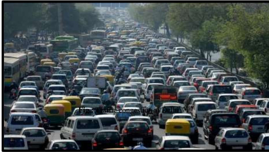
Fig.: Traffic congestion at Delhi