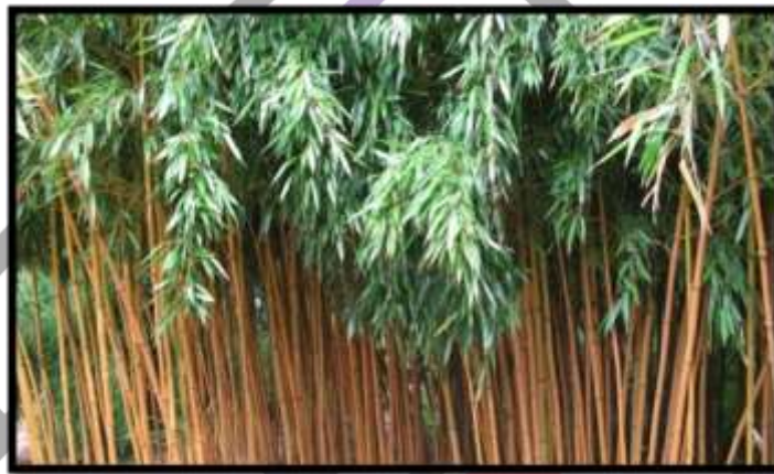
Figure 3 Bamboos (Ampelocalamus)