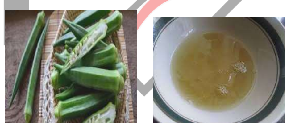
Fig 1: Okra pods