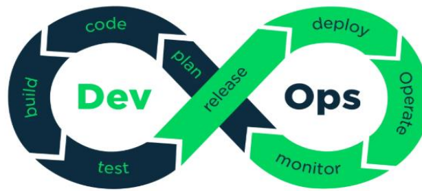
Fig 1. DevOps cycle