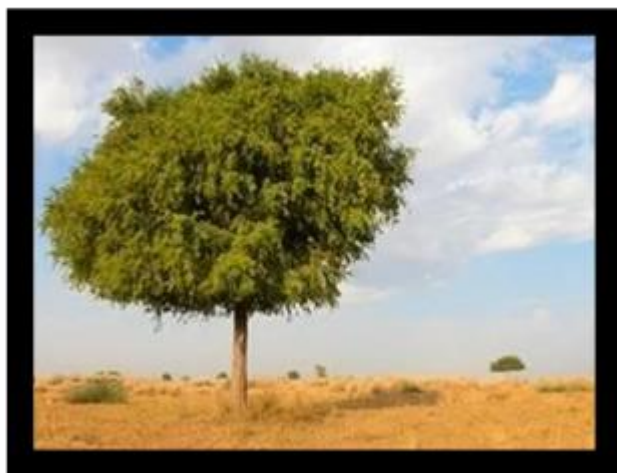
Figure No. 1 - Prosopis cineraria Plant