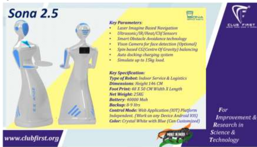
Fig. 6 Sona 2.5 Robot [22]

are: The AIIMS Delhi deployed Milagrow Humanoid Robot & IMAP 9.0 Floor Robot by Milagrow, Chennai hospitals deployed Zafi robot by propeller Technologies, SMS Hospital Jaipur deployed Sona 2.5 robot by Club First to serve food and medicines and take care of patients in the hospitals. Karmi-Bot robot design by Kochi-based Asimov Robotics, perform the functions conducted by above mentioned robots, along with that it also was able to disinfect the premises using ultraviolet radiations. The IITs of India developed various drones, robots and tools to disinfect premises and helped in treatment of COVID-19 patients. IIT Guwahati develop two types of drones one to disinfect the premises and second to help in thermal screening of individuals and two robots to provide food and medicines and to collect garbage in isolation wards of hospitals. IIT Bombay has developed digital stethoscope which can listen to the heartbeat of a patient and record it to minimize the risk of healthcare workers and doctors of coming in contact with COVID-19 patients.