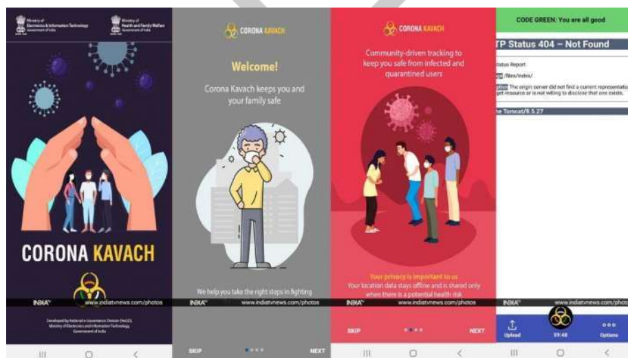
Fig. 5 CORONA KAVACH app[19]

4.5.5 Corona Kavach app [19]: Ministry of Electronics and Information Technology in association with the Ministry of Health and Family Welfare develop this app, which is a location based COVID-19 tracking app to alert the users when they are at a risk of getting contaminated by the virus by coming in a proximity of another person affected by Corona virus or at a high risk, it also provides the information about COVID-19 cases in India. After asking a series of questions this app will provide you the status of all good, see a doctor, quarantine and infected.