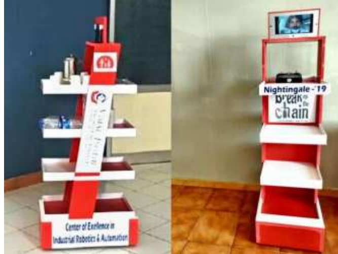
Fig2. Nightangle-19 Robot [10]

Thalasseri. The government also used GoK – Kerala Direct mobile app to provide general announcement, information, guidelines, quarantine protocol details, health and safety tips details to the visitors of Kerala.