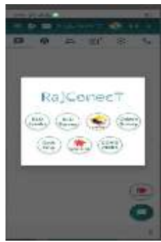
Fig. 4. RSMP-RajConnect app[17]