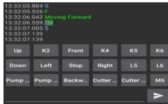
Fig. 3: Display of Software Output on Mobile Phone