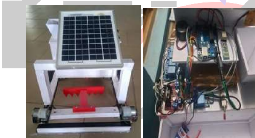
Fig. 2: Agricultural Rover Prototype Front View and Back View

The design of hardware components is done and processed by Arduino UNO.