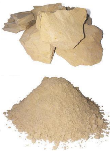
FIG.2 Multani Mitti

Multani Mitti (Calcium Bentonite): Multani Mitti will remove all impurities and dead skin cells from your skin. Multani mitti is good for irritated and aggravated skin. Its cooling action calms the skin and relieves inflammation brought on by aggravated pitta. It removes accumulated dirt and dead skin cells, revealing fresh, radiant, and glowing skin.