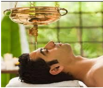
Step 2 Shirahseka