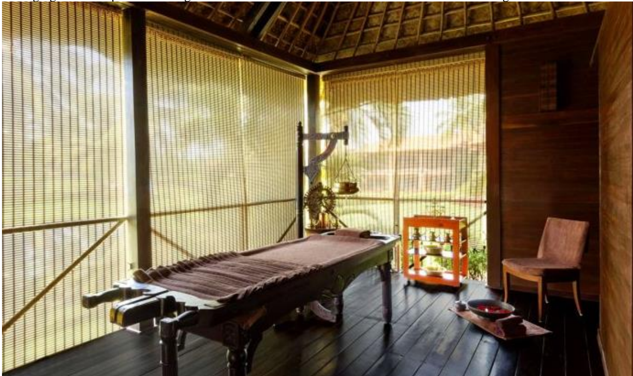
Image I - Classical Shirodhara Instrument.

A jar consisting of gold, silver, other metals, and even clay is described as a Dharapatra in the book Dharakalpa, which contains information about Dhara karma 1536gm. The vessel's base should have a perforation that corresponds to the little finger's middle joint (6) . With the use of cords tied around the vessel's rim, this vessel is suspended from a stand. To ensure continuous flow of the substance, an appropriate wick needs to be suspended from the base of the object. The wood Shirodhara stand has a hook at the top end for hanging the Dharapatra. The height of the traditional stands was fixed and could not be changed.