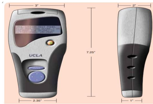
University of California Los Angeles's Oral Fluid NanoSensor Test.

4. Subgingival Irrigation: Hayakumo et al has described the use of ozone nanobubble water produced by nanobubble technology in subgingival irrigation. The results of their study demonstrated that it can be used as an adjunct to periodontal therapy because of their enhanced antibacterial activity [13] .