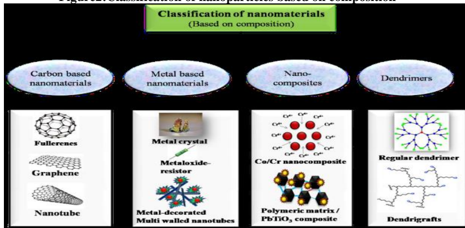
Figure 2: Classification of nanoparticles based on composition [10]