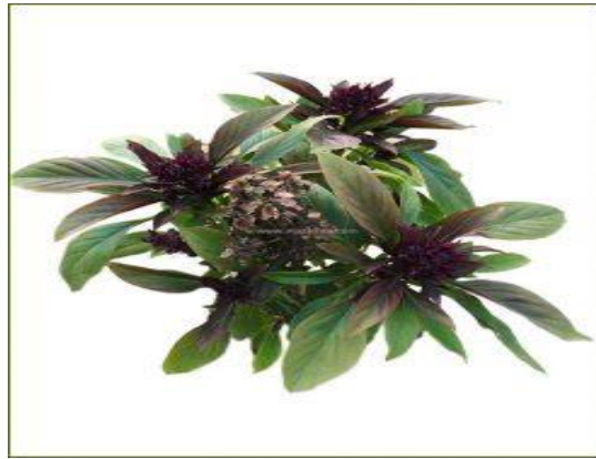
Fig.N07 Thai Basil