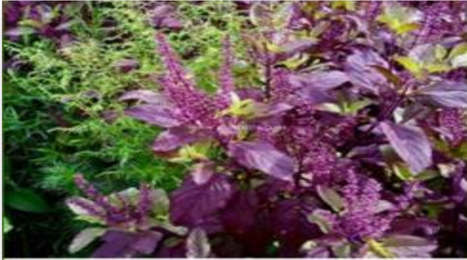
Fig No.03 Krishna Tulsi