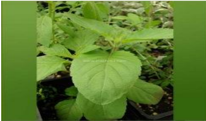
Fig No.05 . Vana Tulsi