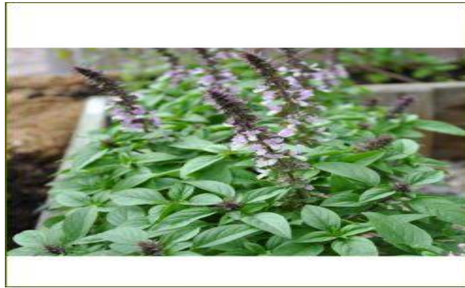
Fig No.12 African Blue Basil