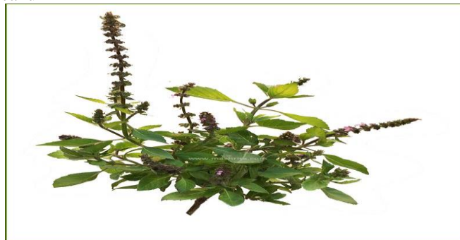
Fig No.11 American Basil