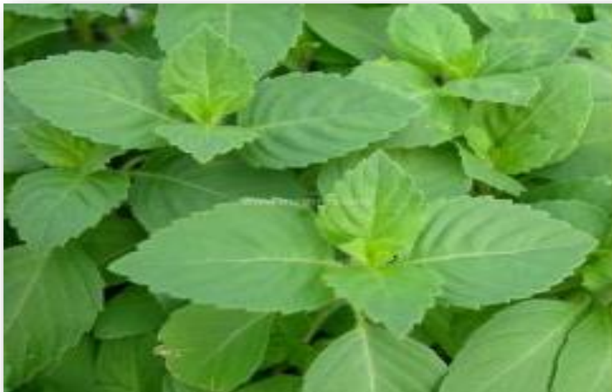
Fig No.04 Amrita Tulsi