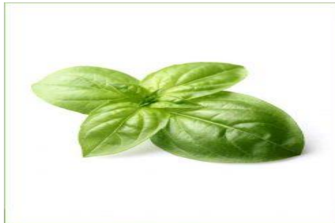
Fig No.06 Sweet Basil