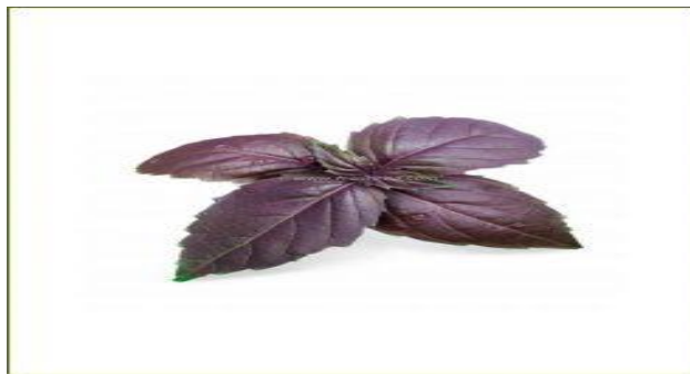
Fig No.08 Purple Basil