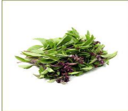
Fig No.10 Vietnamese Basil