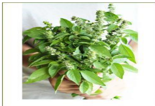
Fig No.09 Lemon Basil