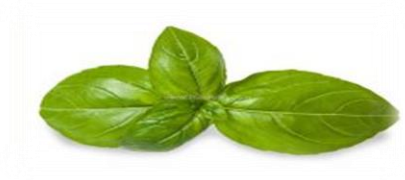
Figno.13 Italian Genovese Basil