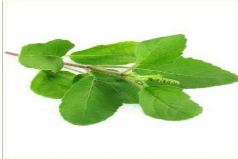
Fig No.02 Rama Tulsi