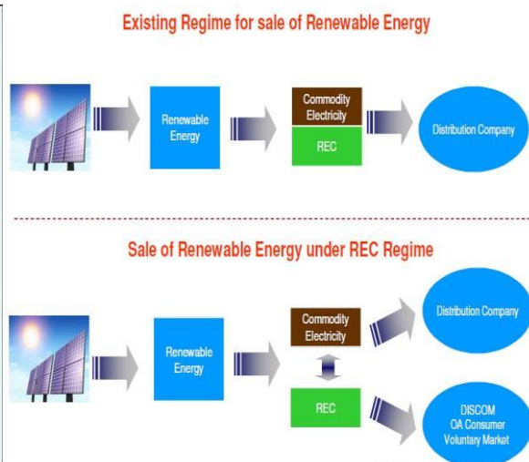
Fig. 4 Sale of renewable energy under REC regime